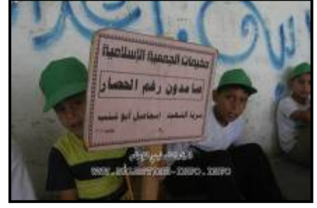
Pictures from summer camps run by Hamas-affiliated societies. Left: Camp run by the Dar al-Qur'an society where segregated groups of young men and women memorize the Qur'an. Center: Hamas administration prime minister Ismail Haniya visiting a summer camp in Khan Yunis. Right: The group named after "shaheed" Ismail Abu Shanab, one of the Hamas leaders in the Gaza Strip, who died in a targeted killing in August 2003. The group belongs to a summer camp run by Hamas's Islamic Association. 9

3) The da'wah supports Hamas's routine activities in the PA-administered territories by providing funds for political activity, its media, "information" and propaganda networks in the PA-administered territories and beyond, and by providing financial services. Sometimes, in our assessment, the da'wah funds are also trickle into its military-terrorist networks .