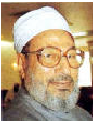
Sheikh Dr. Yussuf al-Qardawi, chairman of the Union of Good's board of trustees.

5. The chairman of the board of the Union of Good is Sheikh Dr. Yussuf al-Qardawi , one of the most important Muslim clerics of our time. Egyptian by birth, he was forced to leave in the 1970s and now lives in Qatar. His extremist opinions regarding Israel are well-known, and for Hamas is a supreme religious authority even though he is not Palestinian. In the past he issued Islamic religious edicts ( fatwas ) calling for jihad against Israel and the Jews and sanctioning suicide bombing attacks. In March 2002, shortly after women began carrying out suicide bombing attacks, he was the first to issue a fatwa allowing such actions. 7 As a senior Islamic authority and head of the Union of Good, he has provided religious Islamic justification for transferring funds meant for charity to terrorist organizations such as Hamas, as an expression of “financial jihad.”